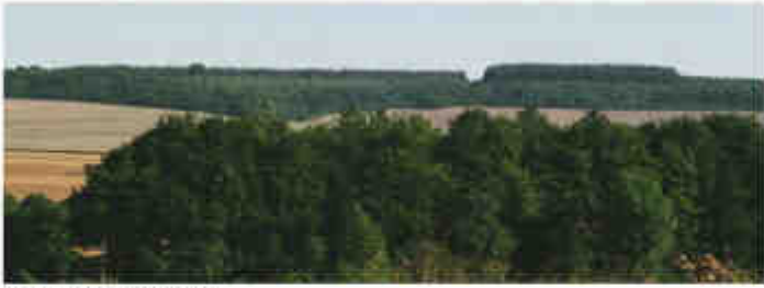
Great Ridge woodland

We would like to know if you are interested in saving money on your fuel bills; being involved in the working woodlands around your home and helping to reduce harmful carbon emissions. Would you consider adding a wood fuel system to your current oil or gas heating? A wood fuel system can either supplant or back up your oil or gas, running radiators or providing hot water. Wood fuel systems have come a long way from the wood stoves and kitchen ranges with which you might be more familiar. Modern systems are clean and incredibly efficient. They can be accurately controlled to give you heat when you want it and produce very little ash. Interested?