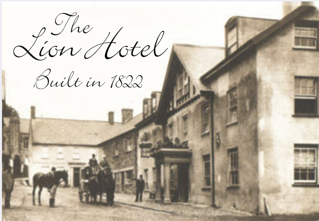
Lion Hotel 1896

The Lion Hotel was built in 1822 in the heart of Dulverton, which is the headquarters of the Exmoor National Park. The Hotel offers customers a warm and friendly welcome where you can relax and unwind. You will find the service friendly and the hospitality second to none.